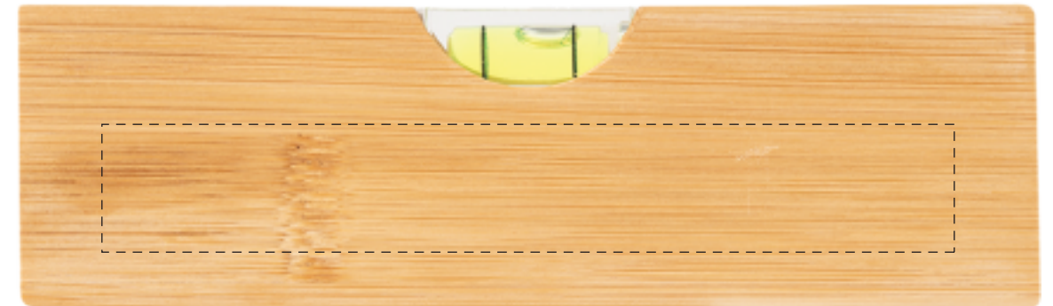
Standard Imprint Area

Laser Engraves Tone-On-Tone. No Oxidation.